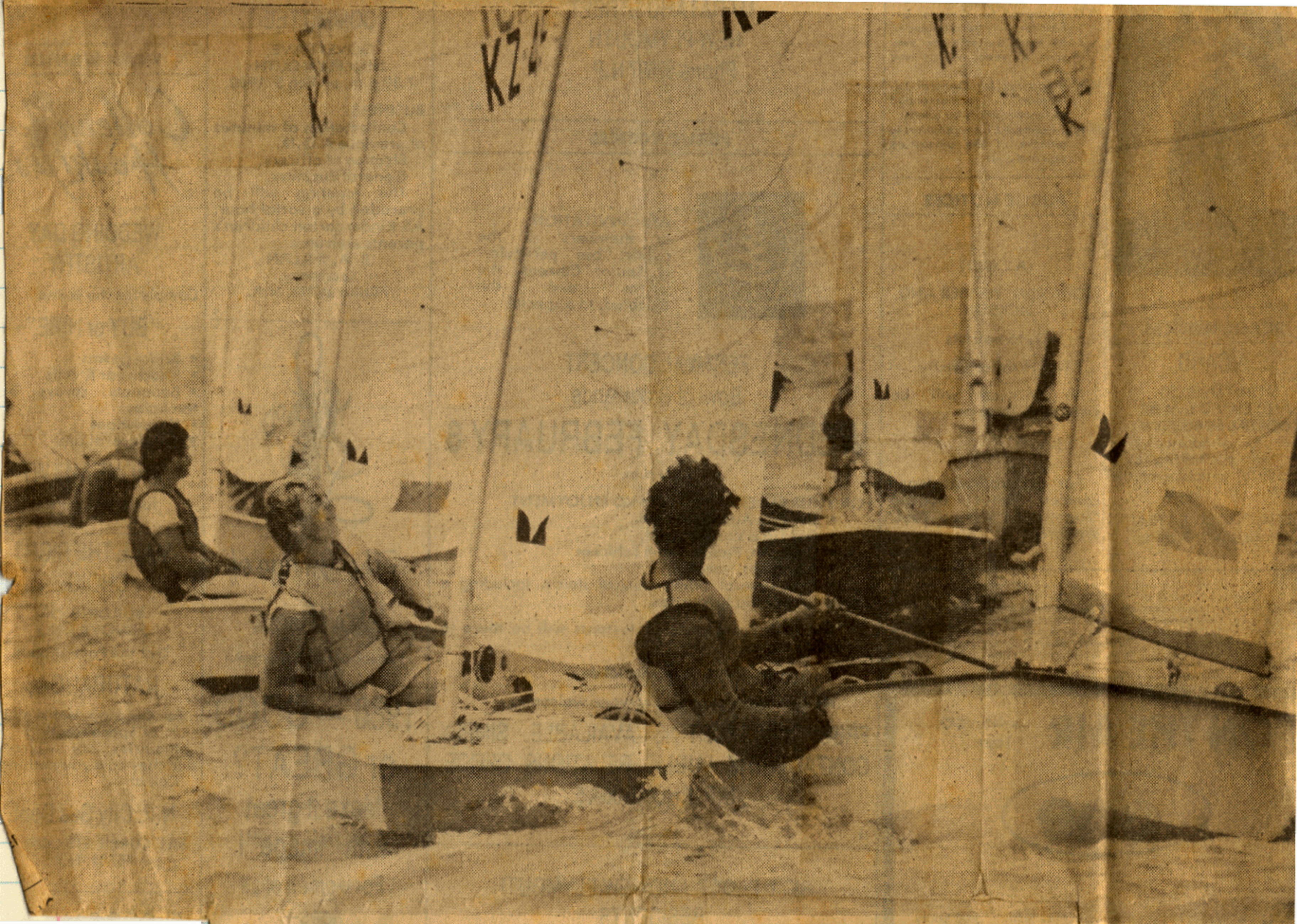
The start of the second race in the OK dinghy yachting championships at Port Taranaki yesterday. The race was later abandoned when the competitors were given a wrong compass bearing to the finishing line.